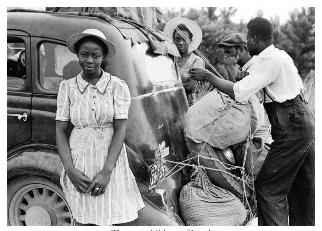
The true children of Israel

Sorry to burst your bubble if you think they looked like this: