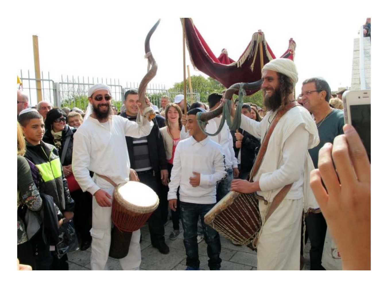
The True Bible Meaning Of Being Grafted In: Revealing the Hidden Danger Of Being Grafted In!